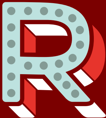
REGULAR + DOTS + SHADING B RIGHT + SHADING BOTTOM

YOU CAN ACHIEVE MORE COMPLEX EFFECTS BY LAYERING UP TO 6 BASIC STYLES.