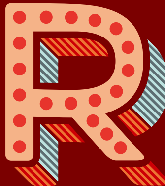
REGULAR + DOTS + SHADING RIGHT + SHADING B RIGHT + SHADING B BOTTOM + SHADING BOTTOM